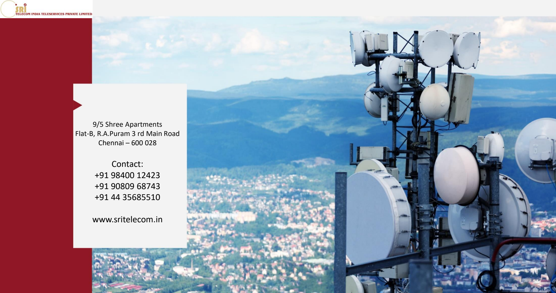
Networking Support for a better tomorrow!